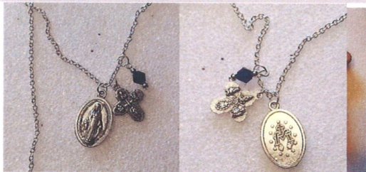
Miraculous Medal with Four Way Cross Pendant $5.00