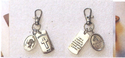
St. Christopher Protect Me Key Ring $5.00

In special honor of our new statue of St Therese