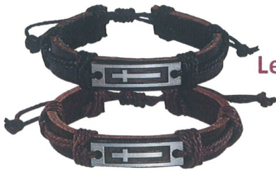
NEW ! $5 Leather bracelet