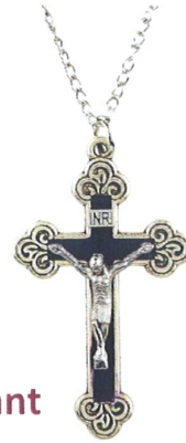
NEW ! $5 Crucifixe pendant