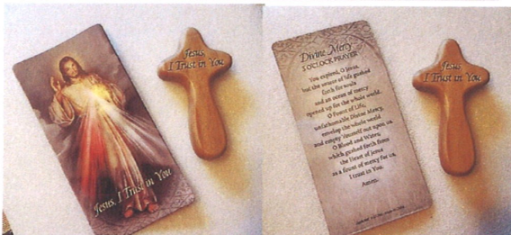
Hand-Held Prayer Cross with Card - Divine Mercy $3.00