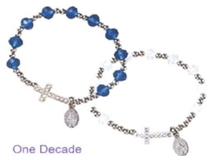
One Decade Cross Rosary $3