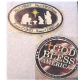
Car Magnets $3

Contact KattEmbody@gmail.com to order online to be shipped