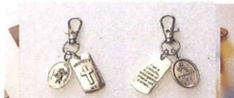
St. Christopher Protect Me Key Ring $5.00

Raising funds to support Religious Education Teachers