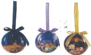
2" Ornament $2 each