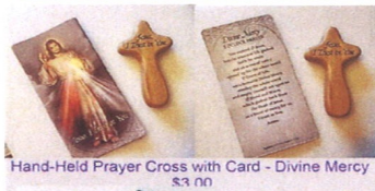
Hand-Held Prayer Cross with Card - Divine Mercy $3.00