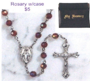
Rosary w/case $5