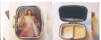
Divine Mercy Pill Box $5.00