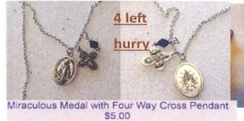
Miraculous Medal with Four Way Cross Pendant $5.00