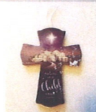
The Child Ornament $3