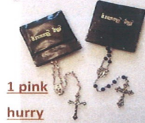
1 pink hurry