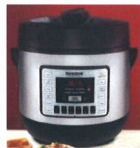
Nuwave 6 qt multi-pressure cooker