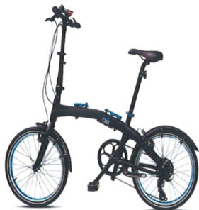
BMW folding bike