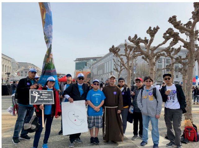
Walk for Life 2019