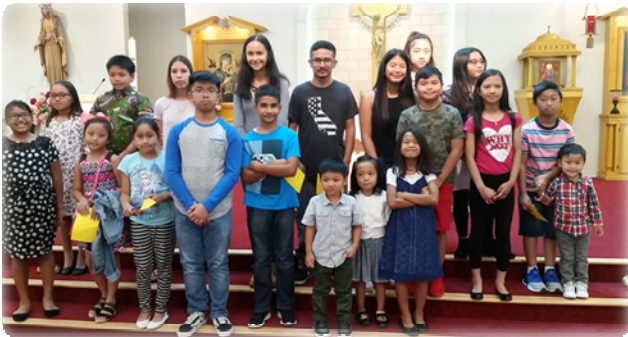
Grades K-5, and the 6th,7th,8th and C2 & C3.

CCD Students in attendance of the mass after enrolling to the Religious Education Program for 2018-2019.