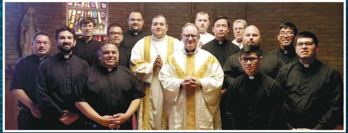
The Seminarians of the Diocese of Oakland present

YOUNG MEN AGES 13-18 ARE INVITED TO JOIN US FROM JULY 15-18, 2018