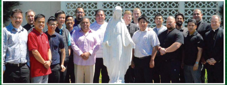
The Seminarians of the Diocese of Oakland present

YOUNG MEN AGES 13-18 ARE INVITED TO JOIN US FROM JULY 9 -12, 2017