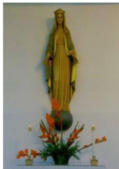
Our Lady Queen of the World