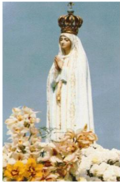
Lady of Fatima

Our Lady Queen of the World Church 3155 Winterbrook Dr. Bay Point, CA 94565