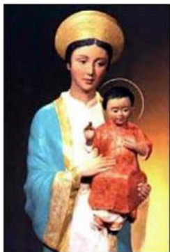
Lady of La Vahn