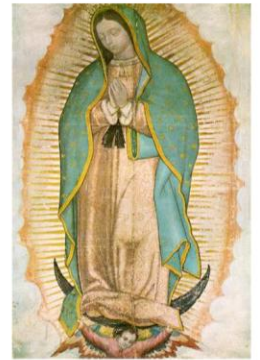
Lady of Guadalupe